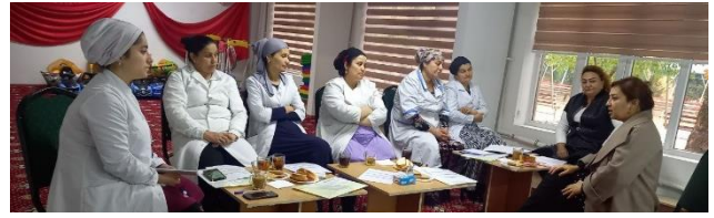
A training at the Children's Home - Detsky Dom

Children with disabilities require particular support and access to early childhood development services. Due to lack of early help and stigma they are the most at risk of being placed in institutional care. Child separation and institutionalisation has life-long consequences for children's development and wellbeing. Sadly, children with disabilities are also particularly vulnerable to violence, neglect, and abuse.